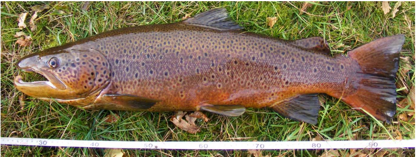
Trout, 700mm, estimated 4.5kg, spawning burn in Loch Maree catchment, 25th October 2011