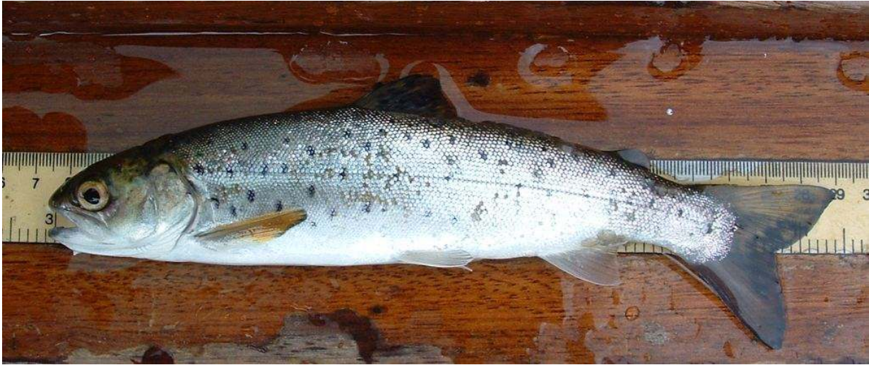
Sea trout, 199mm, taken by rod and line from the River Ewe, 20 th July 2007