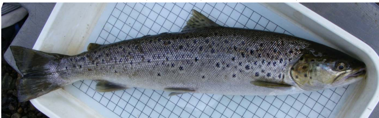
Sea trout, 393mm, taken in WRFT sweep net on 27 July 2010, Flowerdale Estuary, Gairloch.