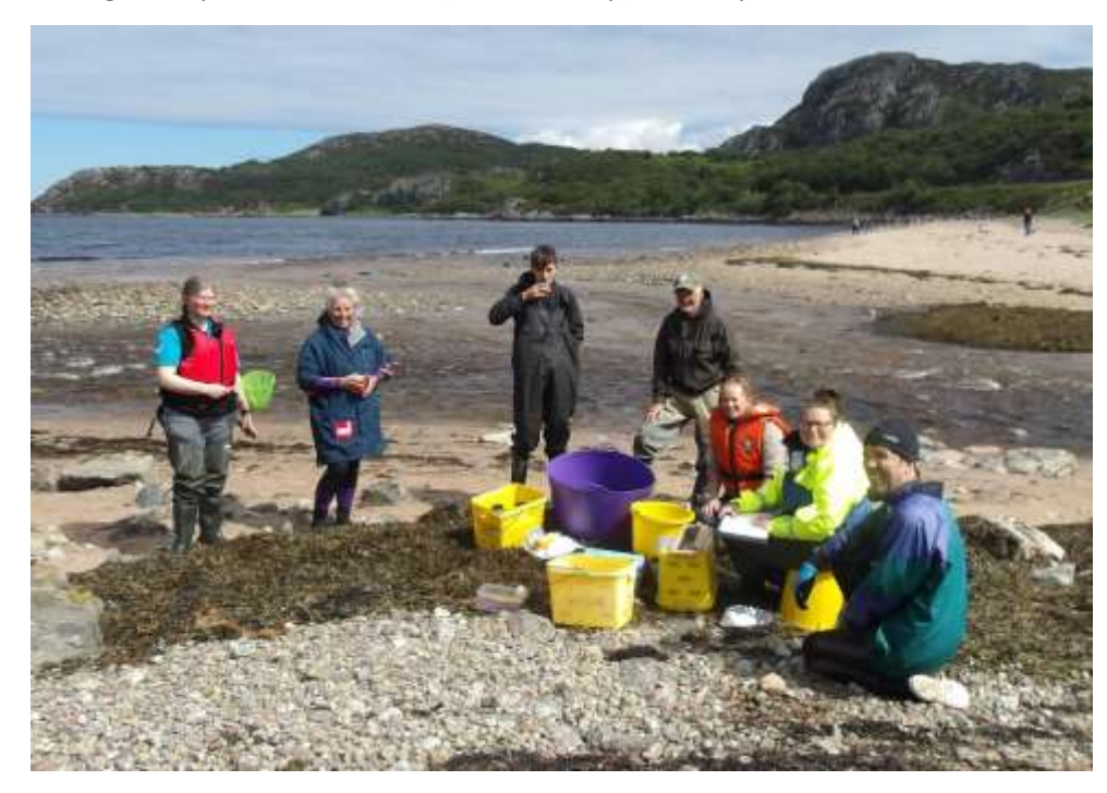
Netting team photo Invierianvie (Gurinard Bay) 30<sup>th</sup> May 2025